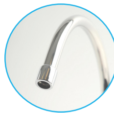
Faucet for use with Below-The-Sink Kit