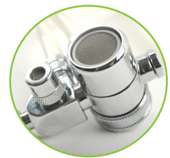
Diverter Valve for use with Countertop Kit